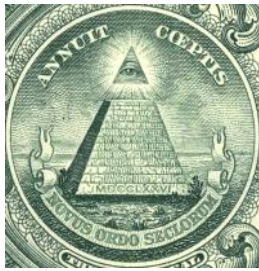
The Luciferian All-Seeing Eye Symbol On The Back of the One Dollar Bill

This coming world government will have power over every nation,