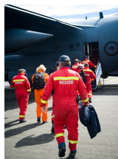
'He Seeks us more than we seek Him'

"the process of being 'born again' gives a person Eternal Security with God."