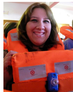
Has He secured our life jacket?

It's a tough call and may be the most difficult decision we have ever taken. It is personally deep and everlastingly crucial. God loves us all and is not willing that any should perish but that all should come to repentance. He seeks us more than we seek Him and longs that we seek forgiveness for our sins which Jesus paid for on Calvary's Cross.