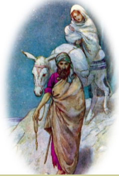
Joseph, Mary and Jesus flee to Egypt

S o what is our response to the millions of people coming to Europe? It must be within God's will in